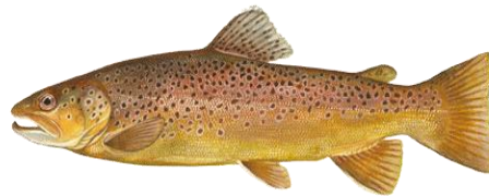
Donner Lake Brown Trout