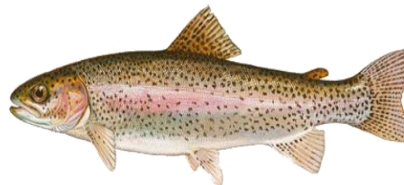
Donner Lake Rainbow Trout

In between Fish Slaying and Camping we may have Ice Cream (like last year) and visit the Donner Museum dedicated to the memory of the ill-fated Donner party, often described by historians as one of the most spectacular tragedies in Californian history and in the history of western migration.