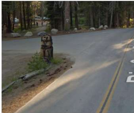
WOODEN BEAR STATUE

Continue to the end of the parking lot next to the Post Office until you see the wooden bear statue.