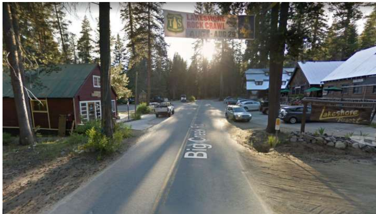
VIEW ENTERING THE VILLAGE OF LAKESHORE

All units are brought into camp via passenger barges which depart from Huntington Lake Public Boat Launch. SPL will organize scouts into a single file line and pass equipment and packs down the line until the barge is loaded, then they will board the barge at the Captain's request.