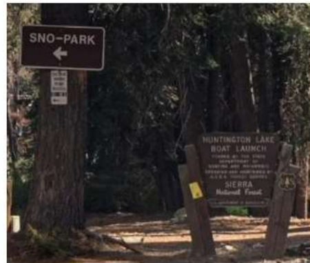
BOAT LAUNCH SIGNS